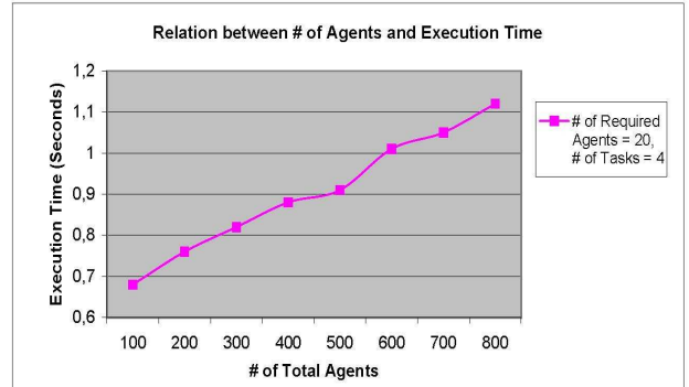
Fig. 2. How problem size affects the execution time (Scalability)